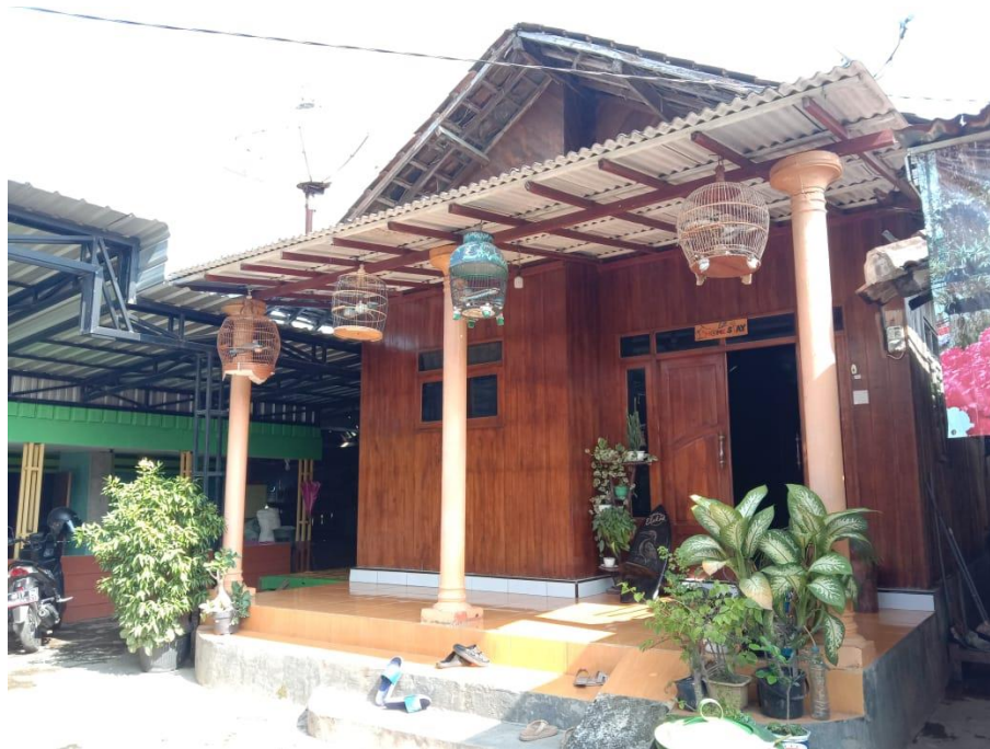
Figure 2. Kampung Blekok Homestay

Services for tourists who use homestay facilities can be in the form of providing knowledge about local attractions and ethics during their visit. Managers must be able to provide education to tourists so that they respect the environment more, such as an appreciation of biodiversity in tourist areas so that the uniqueness of tourist attractions is maintained (Yono, 2020). The provision of productive and innovative activities related to local culture to tourists can give a positive impression so as to increase tourist satisfaction to then make a return visit.