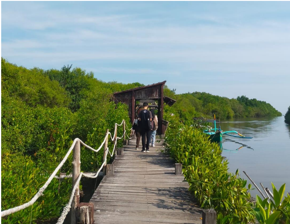
Figure 3. Area of Kampung Blekok

Next is related to artificial facilities. Newly built artificial facilities (all year round) in obtained a score of 0.25 with quite appropriate . The facilities built are gazebos, wooden bridges, and viewing towers that can be an attraction for tourists during their trips.