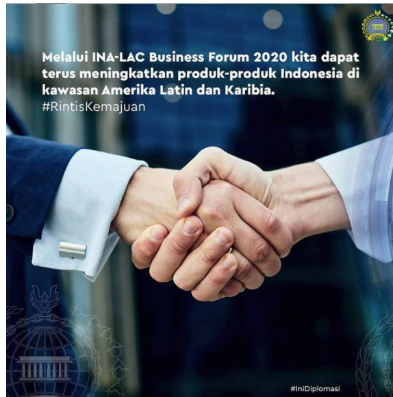
Picture 4. #RintisKemajuan (related to economy diplomacy enforcements).