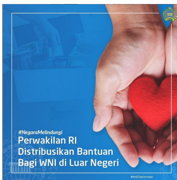
Picture 1. #NegaraMelindungi (protection enforcement for Indonesian citizens)e.g., Interview video with experts, about Indonesian government helping Indonesian in Wuhan to return on January 2020.

The first dimension assessing social media in public diplomacy is to set an agenda setting which one of them, MFA has a strategy to use the same hashtags narration in each social media account. These uniform hashtags reflect Indonesian foreign policy goals. Namely #IniDiplomasi, which it has used in every post that related to Indonesia diplomacy and foreign policy and #SahabatKemlu refers to the audiences. There are four hashtag narratives, that has been designed to follow the related topic of the post.