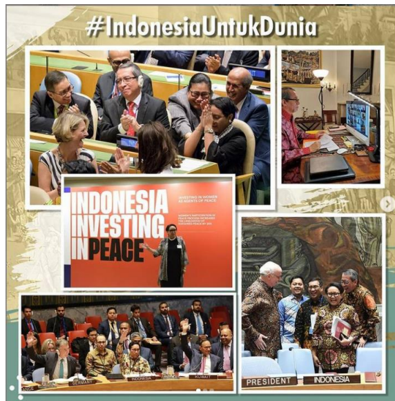
Picture 2. #IndonesiaUntukDunia (a post related to Indonesia's role in international forum)