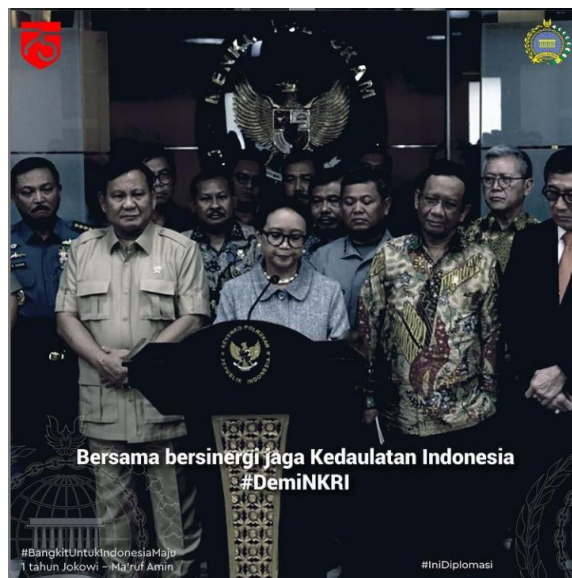
Picture 3. #DemiNKRI (related to enforcement activities to ensure Indonesia sovereignty)